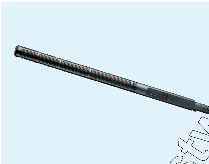
Cable pictured is an accessory not supplied with the microphone

The MKH 70 is a lightweight long gun microphone. Its excellent directivity is particularly suited to applications undertaken in difficult conditions, such as high background noise and distance microphone positioning. Its frequency-independent directivity prevents sound colouration from off-axis sound sources.